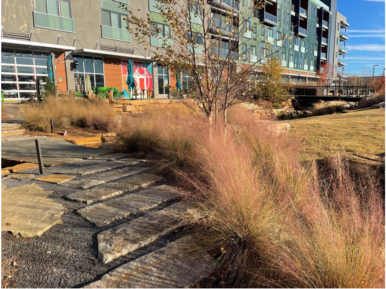
Figure 1 - sustainably repurposed curbs