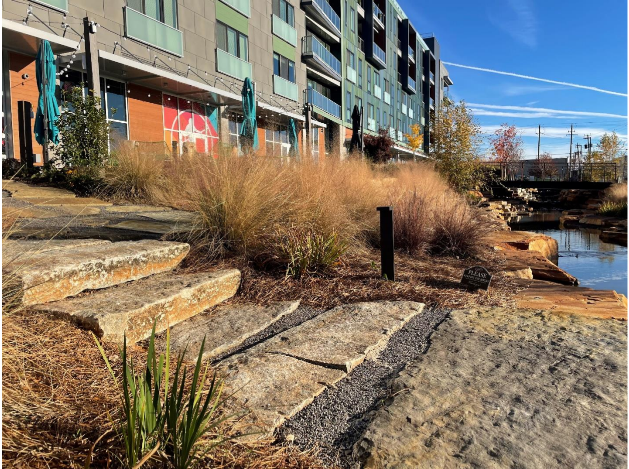
Figure 2 - sustainably repurposed curbs