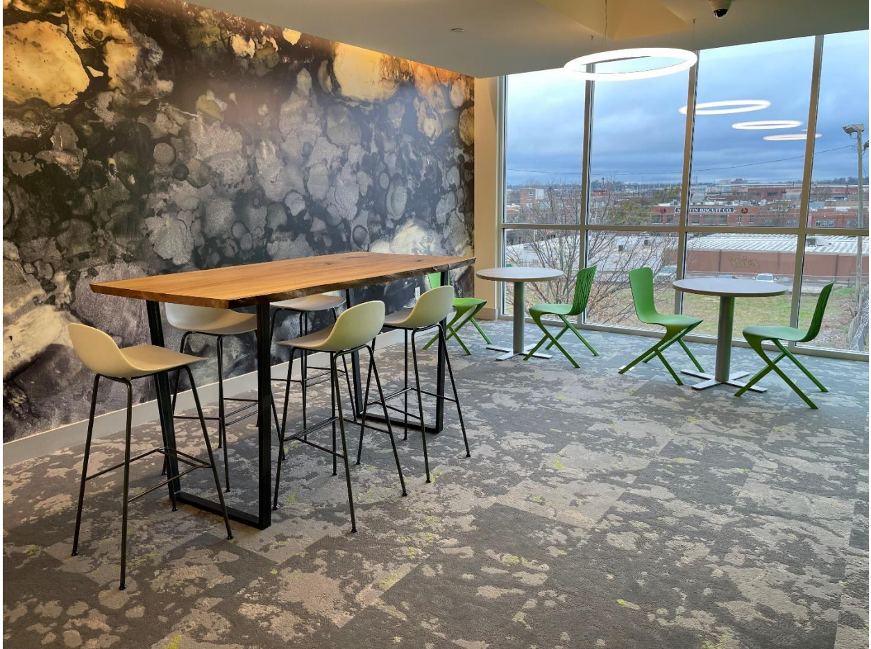
Figure 6 - Resident table top on 3rd floor made from old trees harvested from 5th Avenue