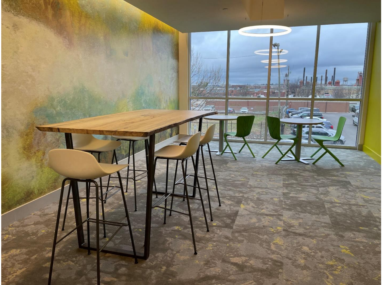
Figure 5 - Resident table top on 2nd floor made from old tress harvested from 5th Avenue