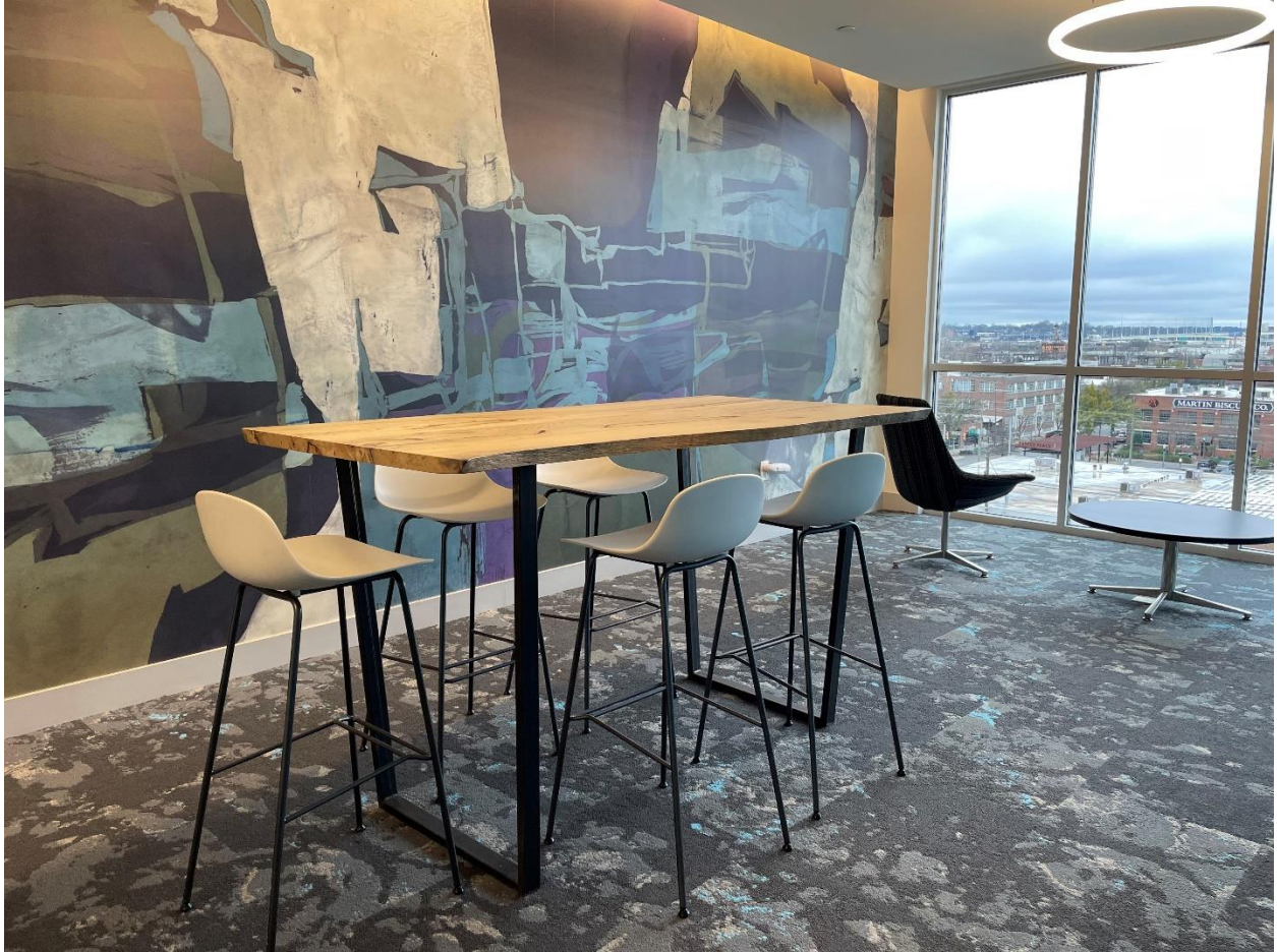
Figure 8 - Resident table top on 5th floor made from old tress harvested from 5th Avenue