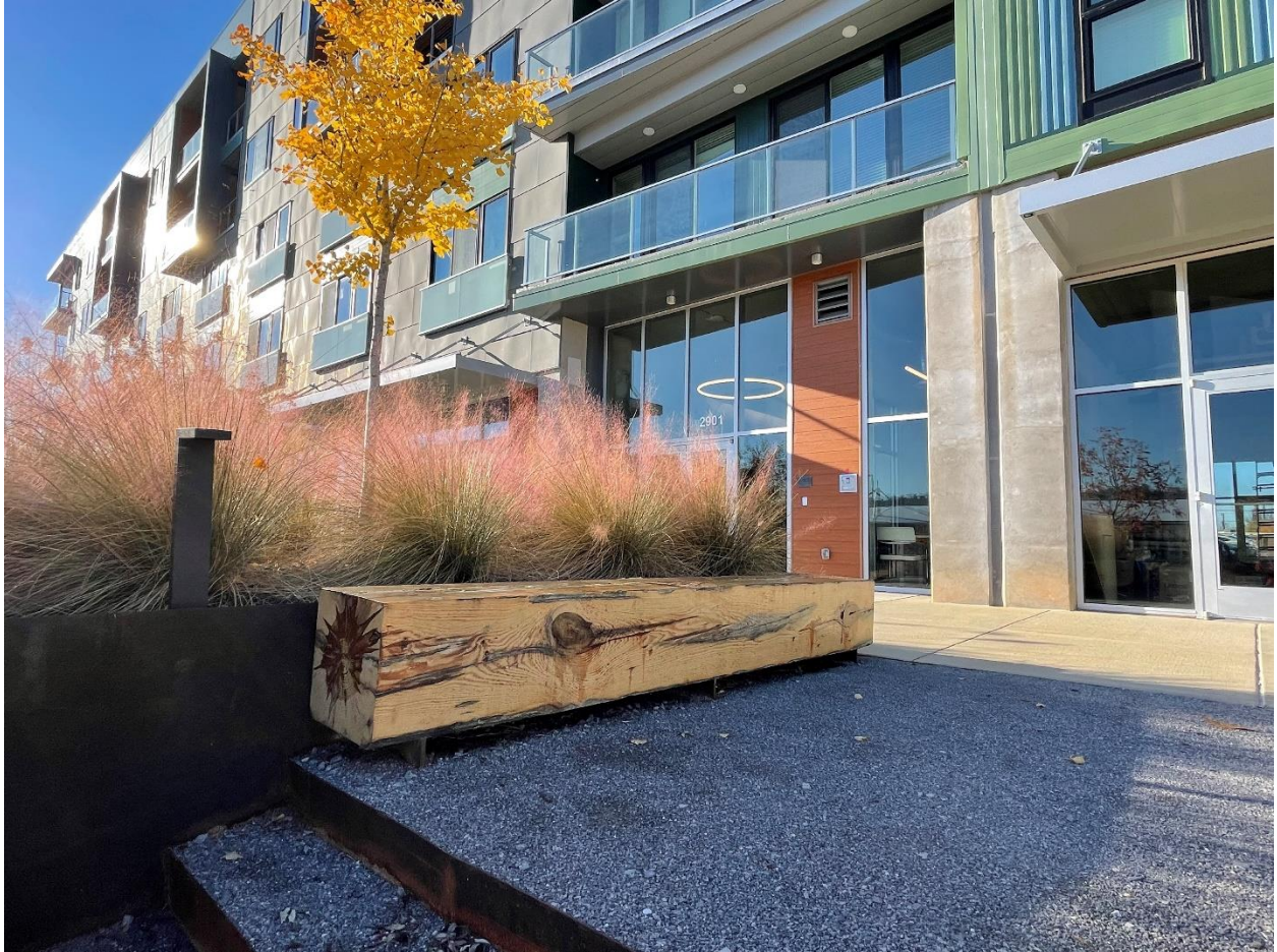
Figure 4 – Sitting bench made from old tress harvested from 5 th Avenue