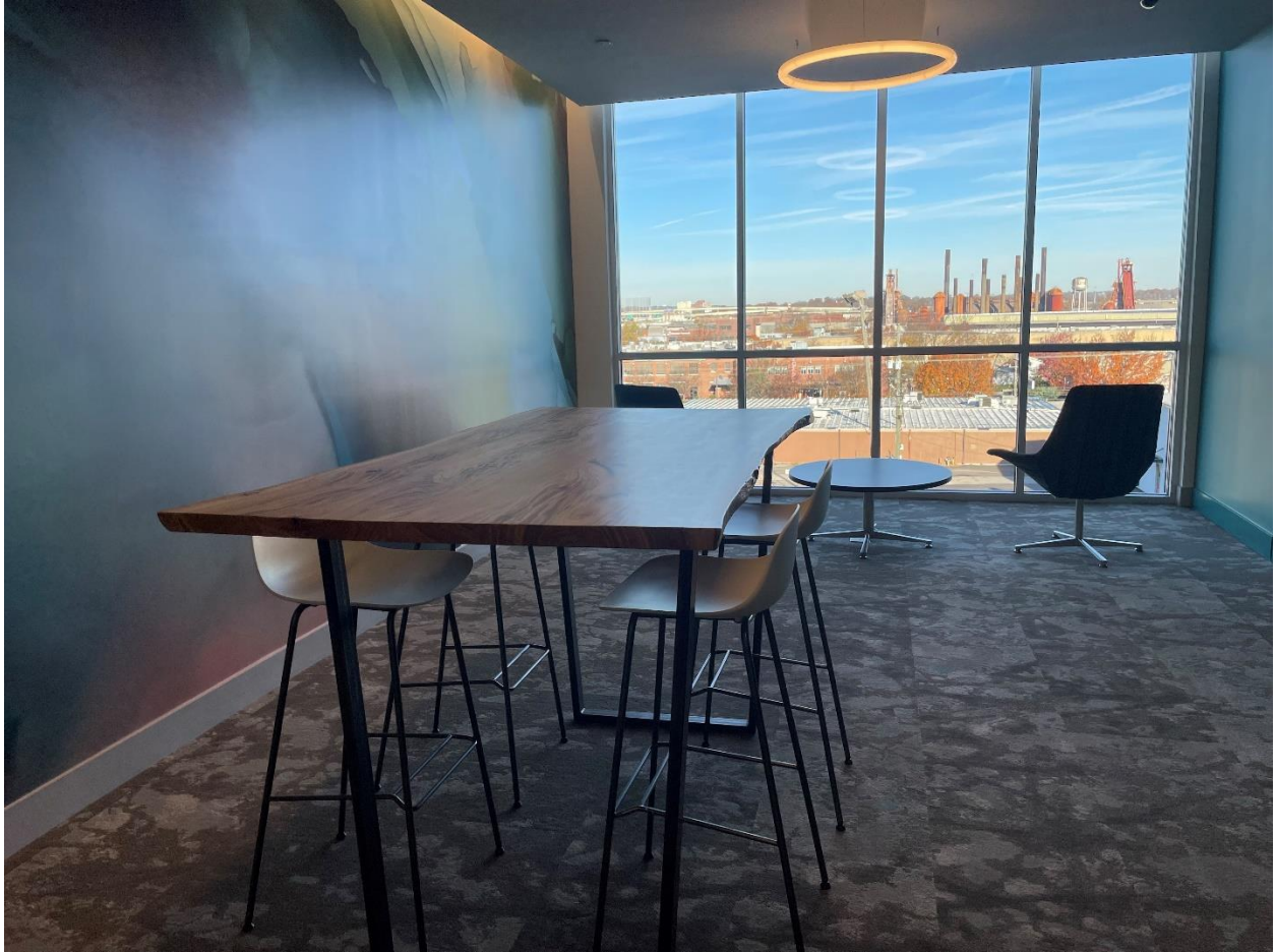
Figure 7 – Resident table top on 4 th floor made from old tress harvested from 5 th Avenue