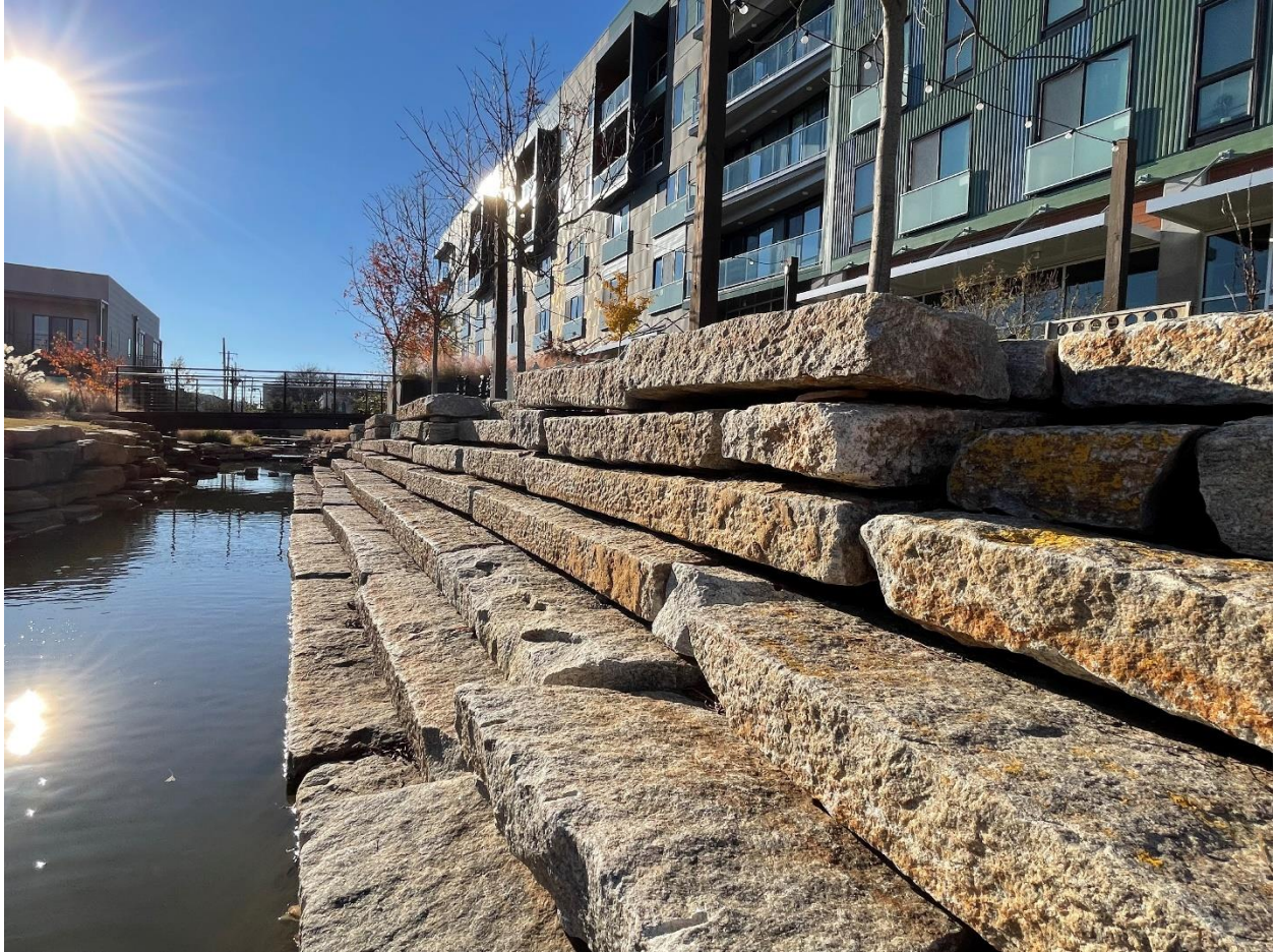
Figure 3 – Note yellow and blue paint on sustainably repurposed curbs